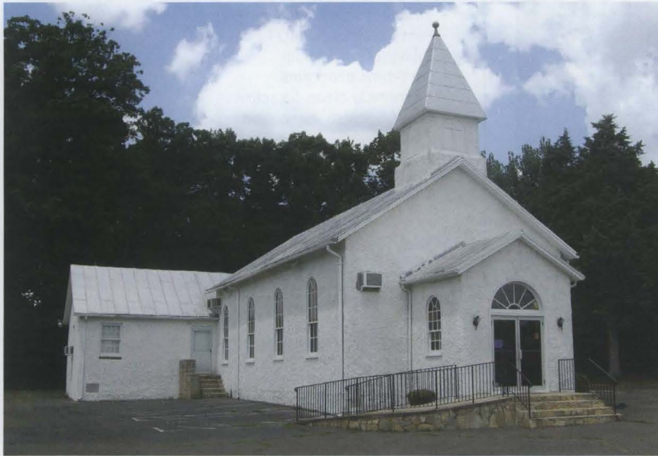
First organized in 1883, Oakrum Baptist Church at Thoroughfare has always played an important role in the community.